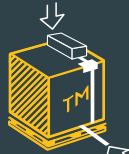
Lowering of head and positioning of fork